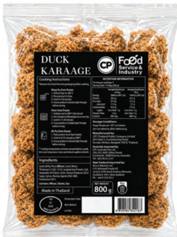
Packaging Type: Printed Plastic Bag Barcode: 8858984842183