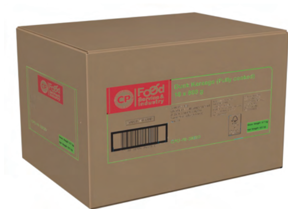
Packaging Type: Cardboard Box Barcode: 18858984842180 Dimensions: 400mm(L) x 300mm(W) x 257mm(H)