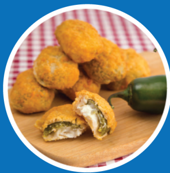
Cream Cheese Jalapenos