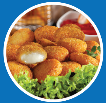
Goats Cheese Bites