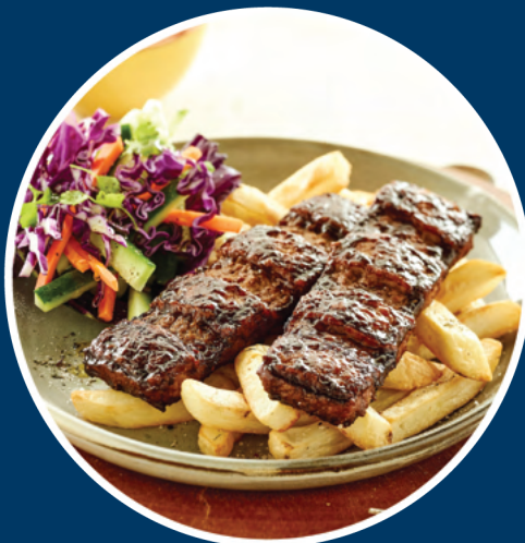
Butler's Pork Riblets