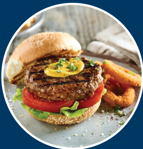
Chef's Choice Beef Burgers