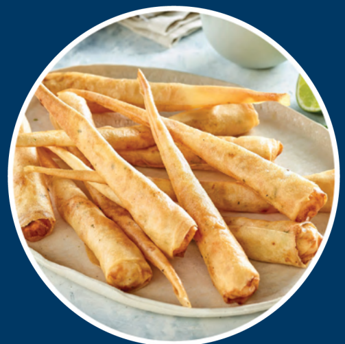
Markwell Prawn Twister