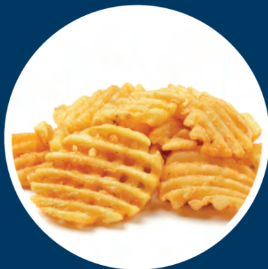
Waffle Cut Fries