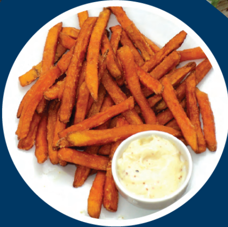
Sweet Potato Fries

The real crowd pleasers! These fun and popular cuts are the perfect 2nd fry option.