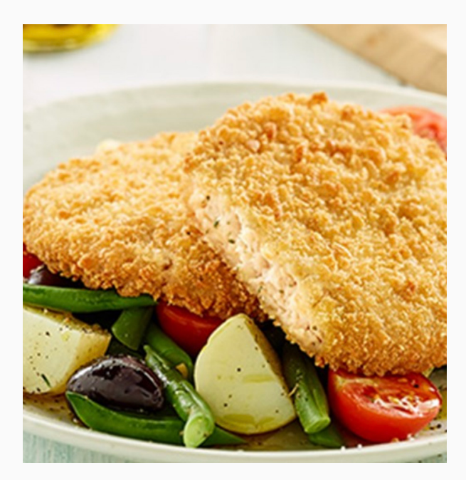
Certifications: HACCP Certified.

Cafes, restaurants, QSR, clubs, hotels, catering, hospitals, canteens and institutions.