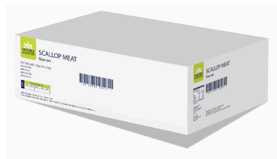
Packaging Type: Cardboard Carton