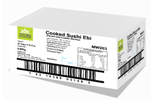
Packaging Type: Tray with Sticker Label