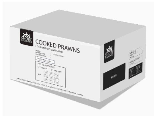
Packaging Type: Cardboard Carton Dimensions: 400mm(L) x 285mm(W) x 255mm(H)