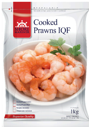
Packaging Type: Printed Foodgrade Plastic Bag